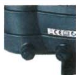
Drainage caps for convenient servicing.