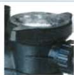
Easy access to the pre-filter through the quarter turn cover