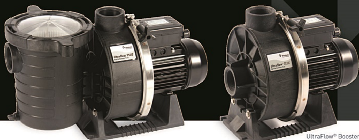
UltraFlow ® Booster