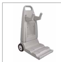
Premium Caddy Cart Model: RC99385