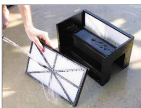
Easy-to-clean filter cartridge